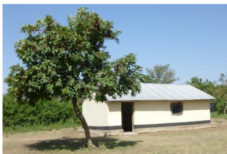
The church in Kikonge