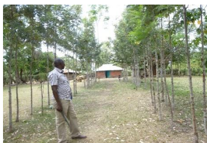
Avenue of trees leading to house

I spent a delightful day driving and walking around Kikonge with Kennedy, stopping to talk to people along the way. Everywhere we