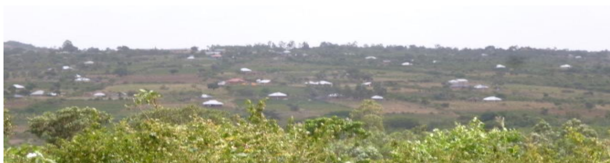
New houses on the hill

I know that they would join me in saying as a final comment 'To God be all the Glory'!