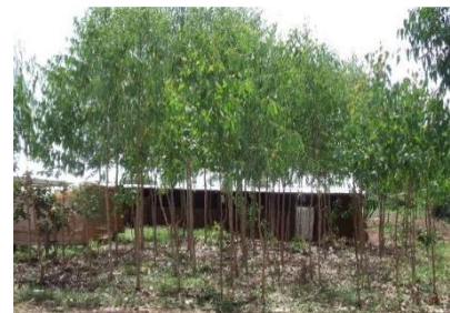
Young trees in Kikonge

Meanwhile trees were still being planted; Kennedy estimates that after three years as many as six hundred families were involved in tree planting in one way or another. And as the trees grew and transformed the landscape, the lives of an increasing number of people in the area were also being transformed.