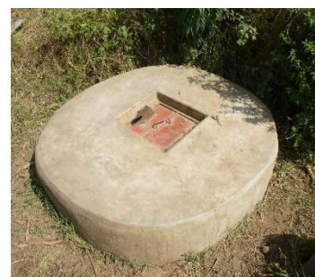
Well in Kikonge

Phillip also mentions what a blessing it's been to the area having the new well available in times of need. On some land owned by Kennedy, and with some financial help from 5000Plus, a well has been dug that gives a good quantity of clean water. When the river dries up, this well is opened twice a day to allow people access to clean water, which has literally been lifesaving in recent serious droughts and cholera outbreak.