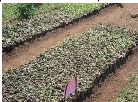
Saplings ready for sale